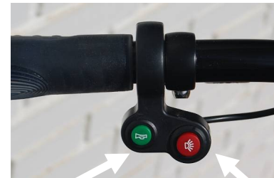
Horn / Light Switch ,ON' – ,OFF'